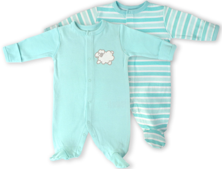
H751/2 - 2pc/pk Classic Pastels Sleep N' Play

Sizes 0-3, 3-6, 6-9, 9-12mo. SGWM Hanger Packing