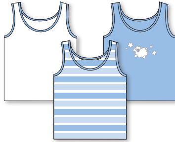
371/3 - 3pc/pk Classic Pastels Sleeveless Shirts

Sizes 0-3, 3-6, 6-9, 9-12mo. SGWM Box Packing