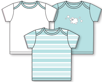
151/3 - 3pc/pk Classic Pastels Lap Shoulder Shirts

Sizes 0-3, 3-6, 6-9, 9-12mo. SGWM Hanger Packing