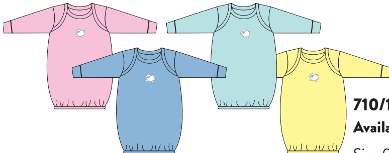
710/1 - 1pc/pk Classic Pastels Infant Gown

Available Only in solid color/case: Blue, Pink, Mint or Yellow