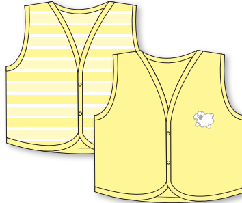
171/2 - 2pc/pk Classic Pastels Diaper Shirts