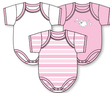
521/3 - 3pc/pk Classic Pastels Bodysuits

Sizes 0-3, 3-6, 6-9, 9-12mo. SGWM Box Packing